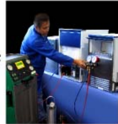
AFTER SALES SERVICES